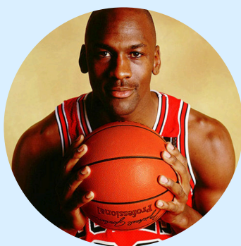
Michael Jordan professional basketball player & UNC alum