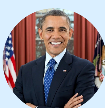
Barack Obama 44 th president of the United States