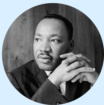
Martin Luther King Jr. Civil rights activist